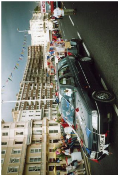
The Club's mini tram no. 10 on its trailer on the sea front during the carnival.